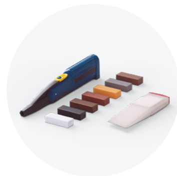
Repair kit QSREPAIR

A sturdy microfibre mop, machine washable up to 60 °C. This mop is compatible with the Quick-Step Cleaning kit.