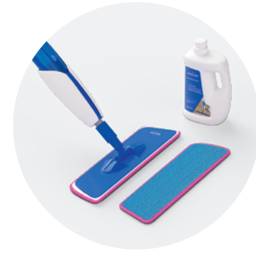
Cleaning kit QSSPRAYKIT

This cleaning product was specifically developed for Quick-Step floors. It cleans the surface thoroughly and safeguards its original appearance, maximising that 'new floor' experience.