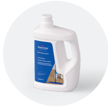
Cleaning product 1 L or 2.5 L QSCLEANING1000 QSCLEANING2500

This cleaning product was specifically developed for Quick-Step floors. It cleans the surface thoroughly and safeguards its original appearance, maximising that 'new floor' experience.